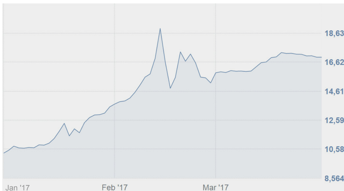
Performance of AdB shares (01/01/2017 - 31/03/2017)

At 31 March 2017, the official price was Euro 16.73 per share, bringing the market capitalisation of the AdB Group on that date to approximately Euro 604 million.